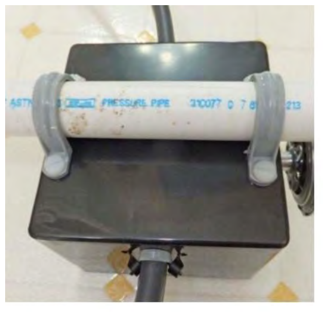
The plastic clamps (and the capacitor) are attached with ½" x 3/16" nylon bolts.

You may need to add heat shrink to the PVC pipe to make the clamps grip it securely. I didn't have to because the two bolts securing the capacitor are on the centerline of the box, I had to drill two holes in the pipe for the bolt heads – this prevents the box from moving. I drilled two 3/8" holes beside each other about 3/8" apart and filed them out till I could pass the double RG-11 (covered in heatshrink) through them. A cable tie inside and outside secure the loop (white in the picture), while two more smaller (black) cable ties through a small hole about ¼" to each side pass through both white ties and jam everything together so they can't shift on the RG-11 loop.