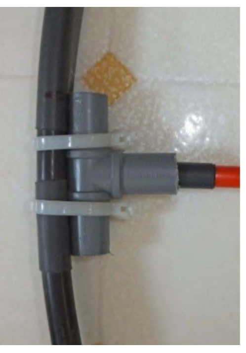
A hose tee with shortened arms is used to secure the loop to the support arm.

The coupling loop I made from 6 gauge solid copper wire is about 7-1/4" in diameter and is permanently attached to the upper section of pipe with a 12 foot length of RG-58 attached. I measured a length of wire 22-1/2" and added an extra 3/8" to each end. After carefully straightening it of any bends (you can roll the wire between two boards to do this - standing on the upper board helps), I bent it around an approximately 6-1/2" diameter pot from the kitchen and when I let go of the ends, it sprung out to a perfect loop slightly larger than what I wanted. I drilled another hole on the back side of the pipe just above the bottom coupler for the RG-58 coax to pass through (round the edges of this hole). Place two pieces of heat shrink tubing onto the loop and remove 3/8" of insulation from each end of the coupling loop; bend sharply at right angles so that the two ends will pass through a ½" hole into the centre of the pipe. Run the RG-58 into the lower hole and out the 1/2" upper hole preparing it by stripping 1" and forming the braid into a pig tail. Solder the braid to one end of the loop and the centre conductor to the other end; cover the bare wires with the heat shrink. Carefully pull on the RG-58 and force the two ends of the loop into the hole, they can be secured there with a cable tie as shown in the following picture. The two soldered ends were separated about 1/8" when in the ½" hole.