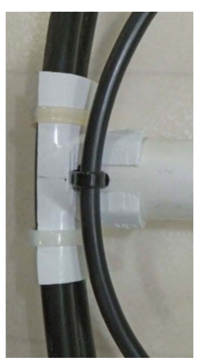
In the above two pictures, you can see how I modified a ¾" Tee by sawing off the upper half (or enough so the cable ties can grip the coax). I then plugged a scrap piece of pipe into it and hand sawed down the side (making sure I was aligned with the T) until reaching the "stop" (ridge inside the pipe). I filed into this stop so that the black cable tie wouldn't keep the pipe from fully seating.

I glued a coupler to the bottom end of the top section, and to the bottom end of the middle section, there is no coupler glued to either end of the bottom section. The two mast sections I use with the table clamp have a coupler glued to the top of each one. I used PVC-40 solvent cement.