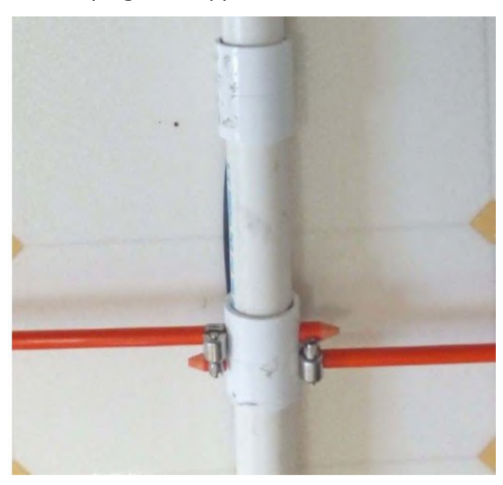
Fiberglass support rods pass through holes drilled in the PVC coupler. Hose clamps work as adjustable stops.

The centre section ended up being 13-1/2" with the coupler glued to the bottom end). Because the flexible coax forming the loop needs additional support at each side, I needed two support rods passing through holes in the centre section. I added a coupler at this loop centre point for more strength/stability. This made the lower pipe half 8" long and the upper pipe 4-1/2"; each coupler adds about 1/8" so the total length (including coupler at bottom) was 13-1/2". I drilled two 11/32" holes through the centre coupler \frac{1}{2}" apart for the 5/16" support rods to pass through. The two fiberglass support rods I cut with a hacksaw to 19-3/4" and then added a 2" piece of heatshrink which extends 1/8" or so past the cut ends to protect you from getting fiberglass splinters. A very small hose clamp works as a stop and let me adjust the length for the best round loop shape. Two garden hose type tees with the hose clamp portion cut off work to plug the support rod into.