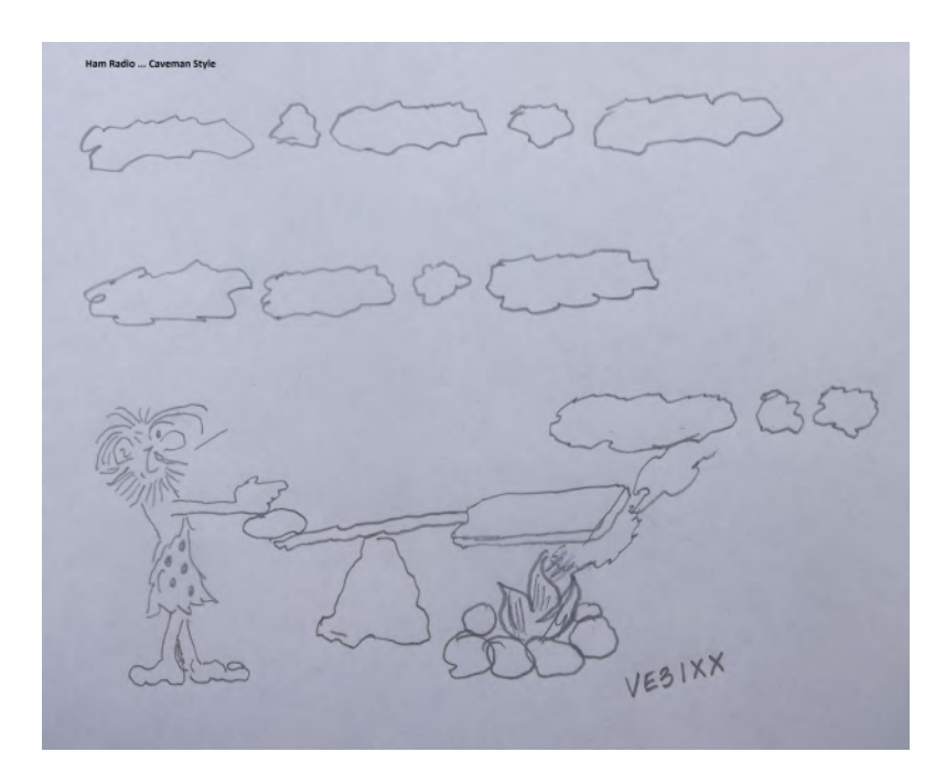
Ham Radio... Caveman Style (He's obviously a beginner! Can you spot his mistake? ....ed.)