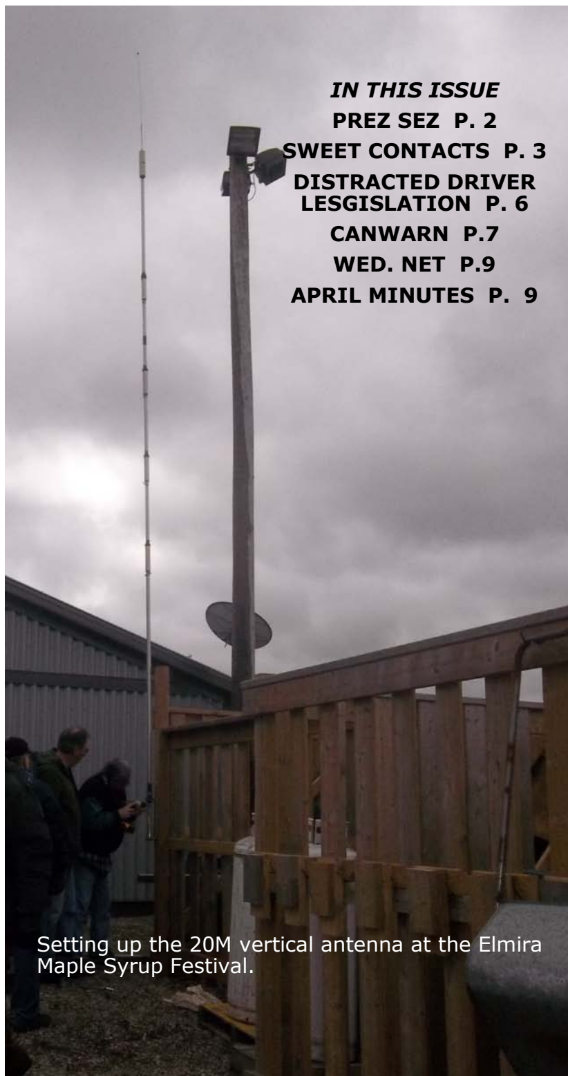
Setting up the 20M vertical antenna at the Elmira Maple Syrup Festival.

PREZ SEZ P. 2 SWEET CONTACTS P. 3 DISTRACTED DRIVER LEGISLATION P. 6 CANWARN P.7 WED. NET P.9 APRIL MINUTES P. 9